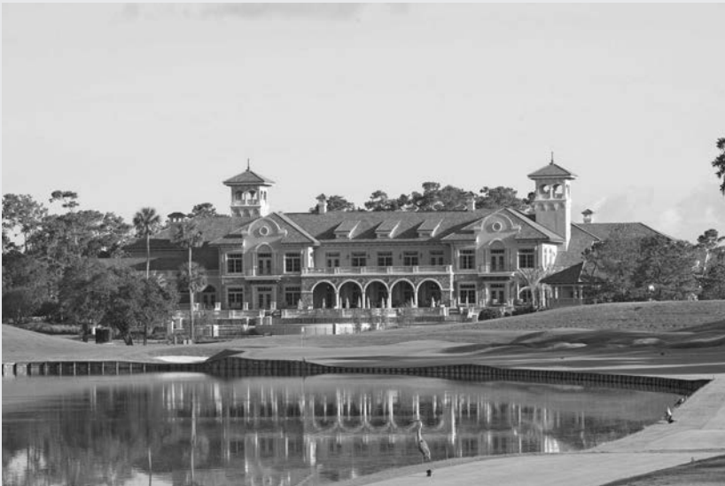
The Sawgrass Golf Resort & Spa, a Marriott Resort, Ponte Vedra Beach, Florida